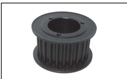
For Powerhouse™ ACHE sprockets, see page 174.

Neoprene 14 mm POWERHOUSE™ HTD® timing belt part numbers can be determined as follows: Pitch Length Code + -14M- + Width Code