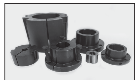
For matching QD® bushings, see page 324.